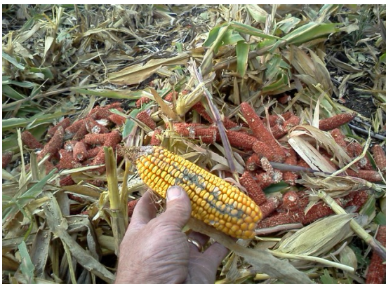
IMAGE COMMENTS: The upper left photo was taken on July 12 comparing the field surrounding the F.I.R.S.T. tests (left) vs. the actual tests (right). The pictures from harvest show the overall plot condition, ear size and grain quality.