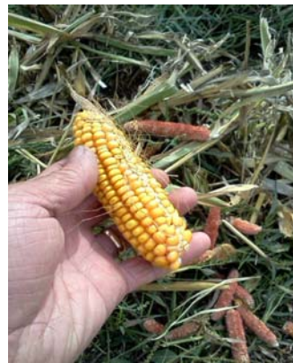
IMAGE COMMENTS: At harvest, some hybrids were totally dead while others were very green and alive. The poor crop canopy allowed late season weeds to further harm crop yields at this site. Ears were small with shallow kernel depth but grain quality was good.